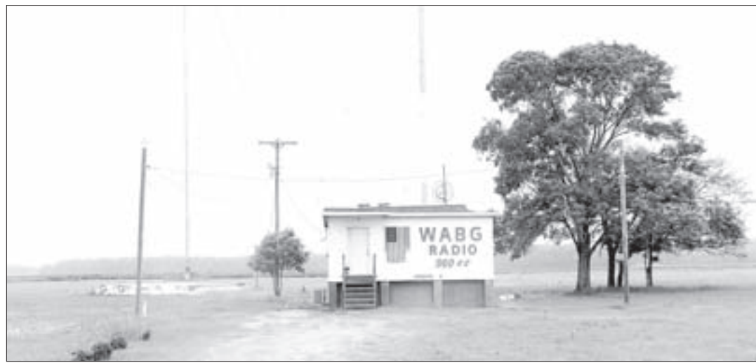
The building housing WABG Radio was built in 1950, located on Money Road in Greenwood.

"Without the community support there is no way we could do this. It is a community effort spearheaded by those who want to give back. Neither the sponsors nor the station gets any monetary gain from the promotion. It's a lot